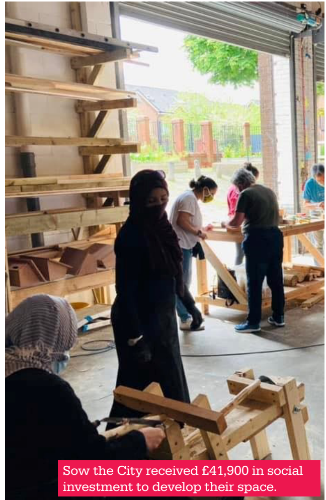
Sow the City received £41,900 in social investment to develop their space.

Our Connecting BAME* Entrepreneurs to Social investment project has supported the creation of a BAME Social Entrepreneurs Network called BASE Network . It also provided capacity building support and physical social enterprise hubs to help BAME social entrepreneurs access appropriate support.