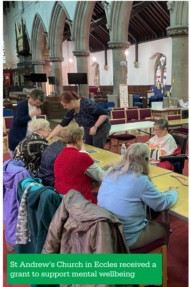
St Andrew's Church in Eccles received a grant to support mental wellbeing

Supporting the Greater Manchester Funders Forum has resulted in the formation of a face to face collaboration group of 16 funders and distributors of