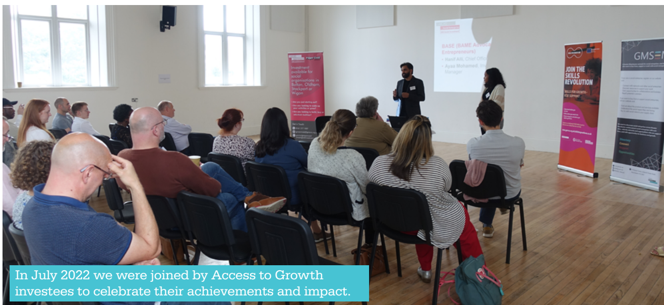
In July 2022 we were joined by Access to Growth investees to celebrate their achievements and impact.