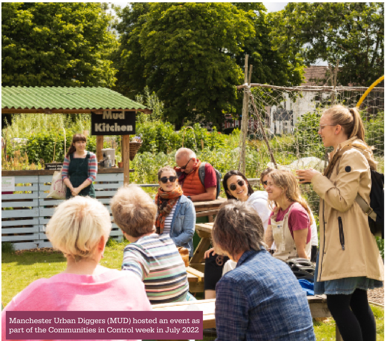
Manchester Urban Diggers (MUD) hosted an event as part of the Communities in Control week in July 2022