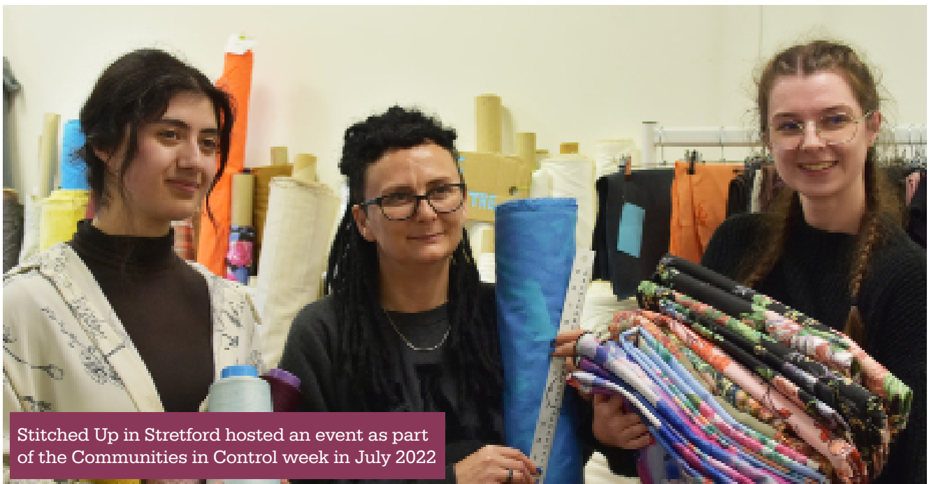
Stitched Up in Stretford hosted an event as part of the Communities in Control week in July 2022

We have continued to use our networks to help us gather insight and intelligence to influence Greater Manchester policy and practice. This year we conducted a follow up exercise on the Big Alcohol Conversation, finding out about the impact of the pandemic on alcohol misuse and the effect this has on communities. The recommendations from this work will feed directly in to the new Greater Manchester Drug & Alcohol strategy.