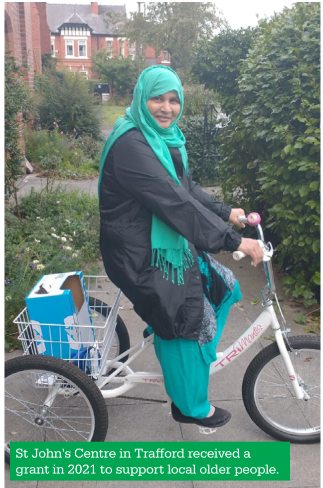
St John's Centre in Trafford received a grant in 2021 to support local older people.