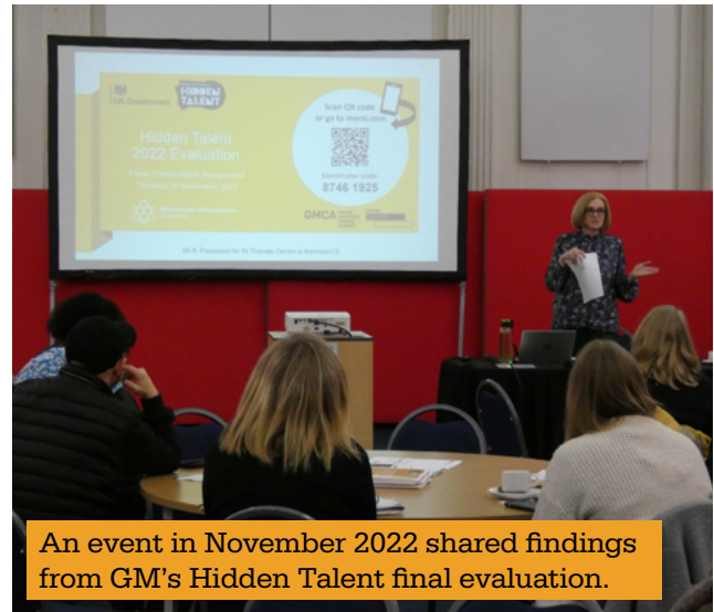
An event in November 2022 shared findings from GM's Hidden Talent final evaluation.